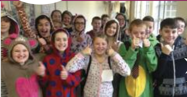
Thank you, Year 7 Diolch yn fawr, Blwddyn 7